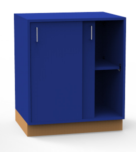
Sliding Door Base Cabinets