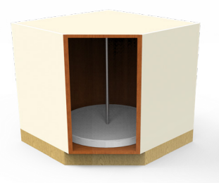
Open Corner Base Cabinets