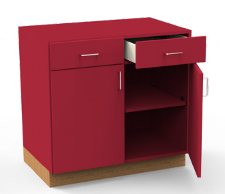
Door & Drawer Base Cabinets