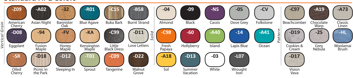
Premium: * Select 1 HPL color on all surfaces

Classic: Select 1 HPL color on exposed surfaces