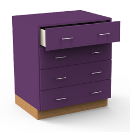
Drawer Base Cabinets

Numerous CaseworkUSA® Base Cabinet configurations and sizes available. Go to www.wibenchmfg.com/caseworkusa for details.