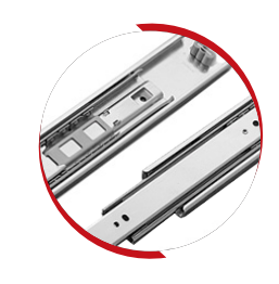
Full Extension Side Mount Steel Ball Bearing Glide