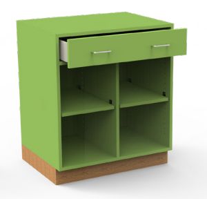
Open Cabinets w/ Drawers