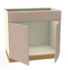
Sink Base Cabinets