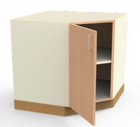
Corner Base Cabinets/ Door