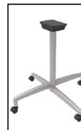
DuraCast Nesting X-Base