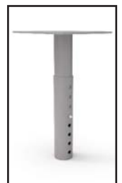
Adjustable Spring Clip