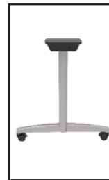
DuraCast T Base