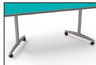
DuraCast T Base Inline