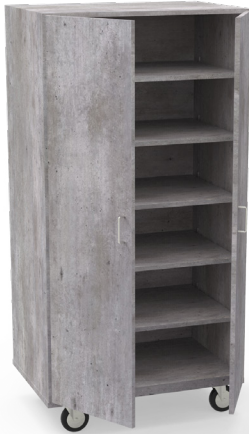
SS5000-3672-5AC Shown in premium finish