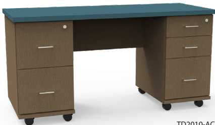
TD2010-AC Shown in premium finish

Translucent totes are standard. See page 432 of the catalog for color selections.