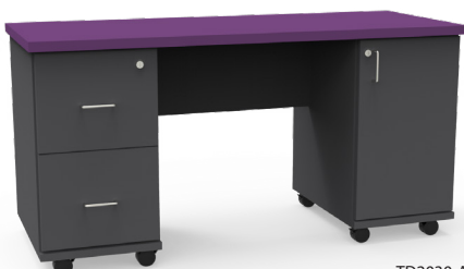
TD2030-AC Shown in premium finish