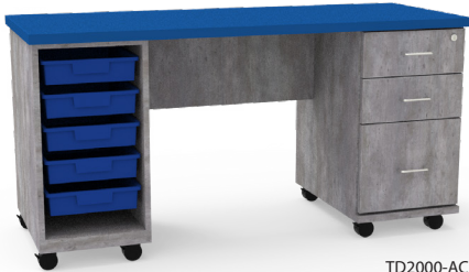
TD2000-AC Shown in premium finish