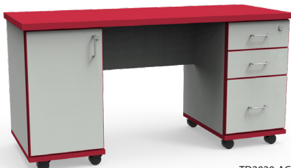
TD2020-AC Shown with optional different colored edge band