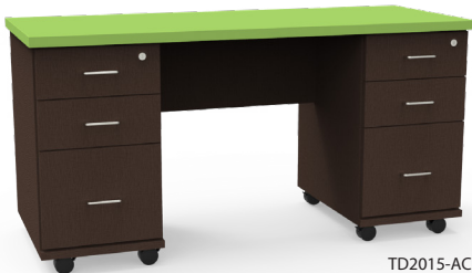
TD2015-AC Shown in premium finish