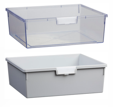
18.5"W x 16.75"D x 6"H

Classic: Select 1 TFL casebody & top color