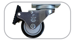
3" heavy-duty locking plate caster