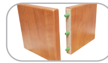
.75" fully doweled casebody construction

Premium cabinets are constructed the same as the Classic EXCEPT the Premium cabinet components are double sided high pressure laminate (HPL) in place of the double sided TFL.