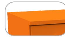
1" TFL top (Classic) 1" HPL top (Premium)