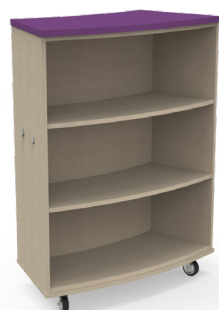
LCD1170-AC Unit shown in Premium finish

Markerboard Back Panel Options (Only available on the Single Sided Curved Bookcases)