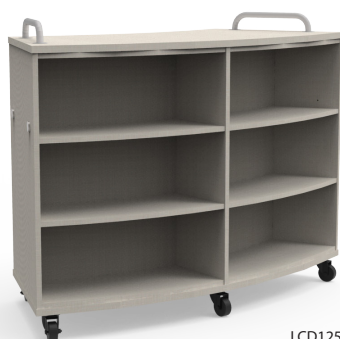
LCD1255-AC Unit shown in Premium finish with optional Top Mount Handles

Sizes Available W: 40.59" H: 36, 42 or 48" D: 23.75" Overall Depth: 24"