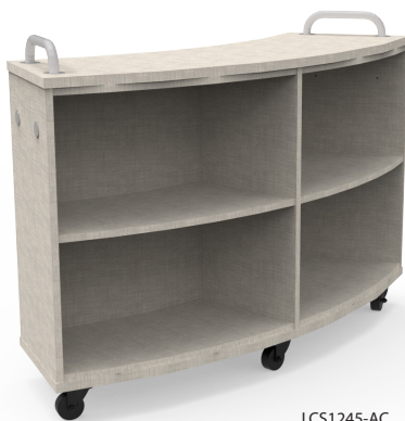
LCS1245-AC Unit shown in Premium finish and with optional Top Mount Handles

Sizes Available W: 36.48" H: 36, 42, 48" D: 16" Overall Depth: 16.25"