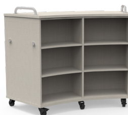
Back View of LCD1255-AC Unit shown in Premium finish with optional Top Mount Handles

Sizes Available W: 60" H: 36, 42 or 48" D: 23.75" Overall Depth: 24"