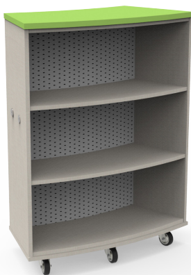
LCS1170-AC-PM Unit shown in Premium finish