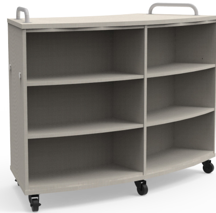
LCD1255-AC Unit shown in Premium finish with optional Top Mount Handles