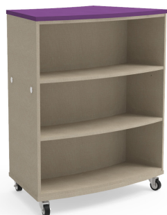
LCD1170-AC Unit shown in Premium finish