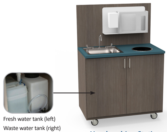
Handwashing Station MCC4500