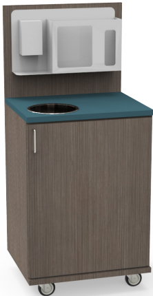
Sanitizing Station MCC3500

Flow rate of .5 GPM, water tanks contain a 5 gallon fresh water tank and a 7 gallon waste water tank with drain hose for easy drain. HM & HJ units include a hot water heater.