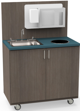
Handwashing Station MCC4500