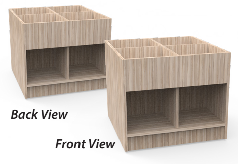
LBN2401 Unit shown in Premium finish