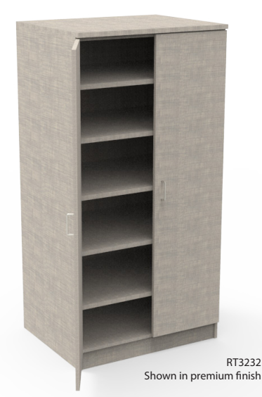
V022720 Specs subject to change.

For a complete listing of cabinets please see our catalog.