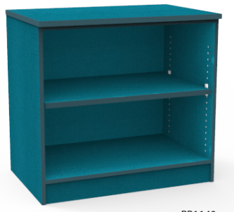
RB1140 Shown in premium finish

Shipping Class: Density Based Class NMFC#: 80440