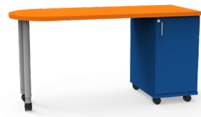
TD6374-31ELS-AC Shown in premium finish