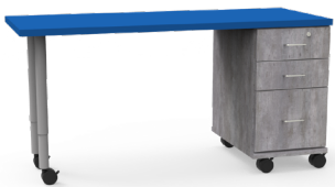
TD6071-95ELS-AC Shown in premium finish