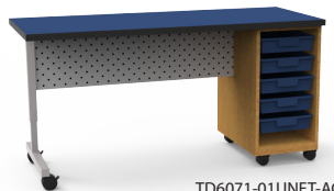
TD6071-01UNET-AC Shown w/ optional perforated modesty panel