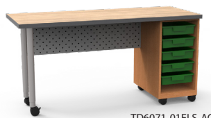
TD6071-01ELS-AC Shown w/ optional perforated modesty panel