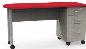
TD6374-95ELS-AC Shown in premium finish and w/ optional modesty panel