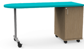
TD6374-31UNET-AC Shown in premium finish