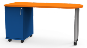
TD6374-33ELS-AC Shown in premium finish