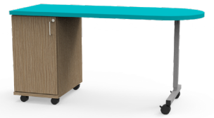
TD6374-33UNET-AC Shown in premium finish