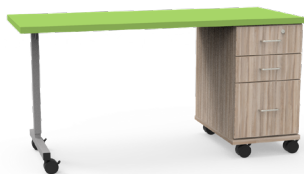
TD6071-95UNET-AC Shown in premium finish