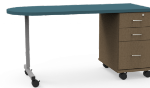
TD6374-95UNET-AC Shown in premium finish