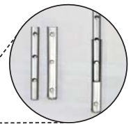
Side and back panels join via metal slip joints