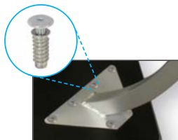
Legs positioned at widest point of desk for stability and attached via threaded metal inserts and screws