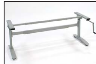
Hand Crank Base

Adjustable frame size to accomodate multiple table lengths, handle retracts under table and interchangeable left to right, maximum recommended light weight is 200 lbs., adjustable glides(standard) or casters(optional).